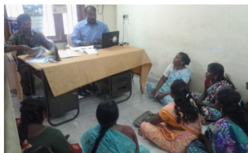
Evaluation by TANSACS Interaction with Staff and Peer Educators