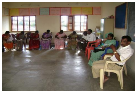
Staff Review meeting in Uthiramerur Project