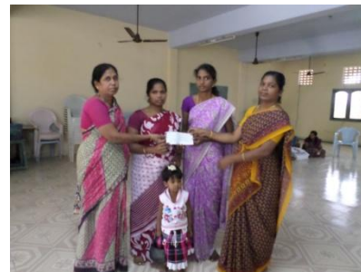
Micro loan cheque issued to our SHG member