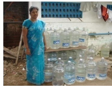
Micro Enterprises run by our SHG members – Petty shop and water can sales