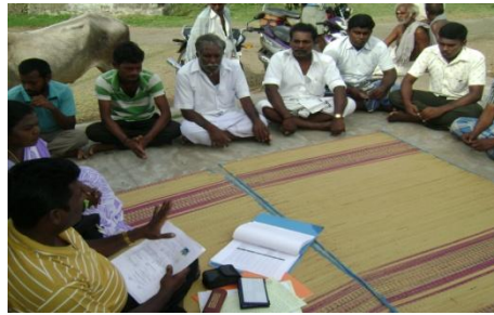
Meeting with Men Self Help Group members in village level