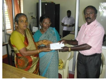
Organised Self Help Group Meeting to women and Issued Micro Finance for running a micro enterprises