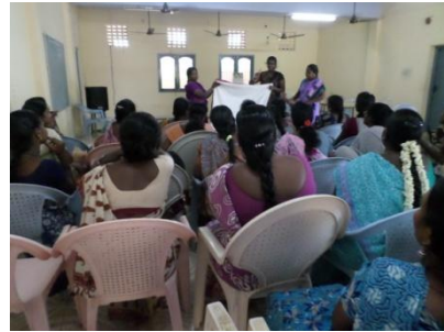
Training on Making Secret Pillows to SHG members Orientation Training on Marketing and sales