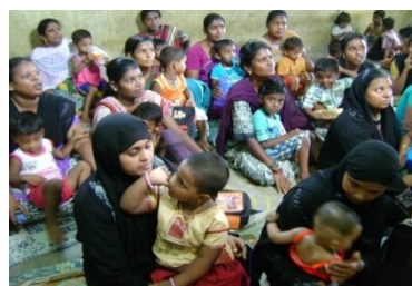
Parents participated in the parents meeting