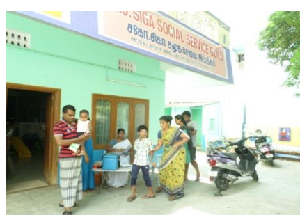
Public health centre nurses in BSSSG