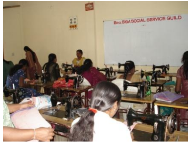
A Tailoring unit for Women