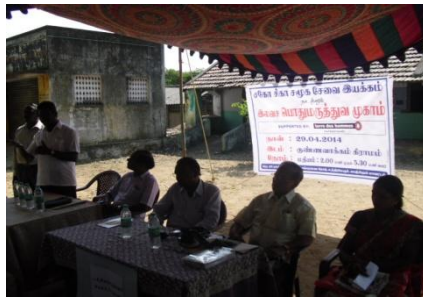
General Medical camp