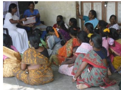
Network with Village Health Post