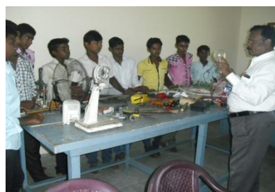
Diploma in House Electrician Course – Theory and Practical