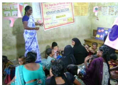
Parents meeting at Child Care Centre