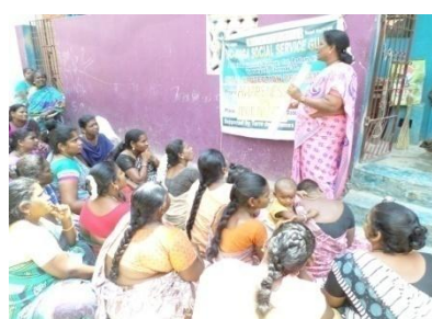
Awareness on Immunisation at B-Kalyanapuram area