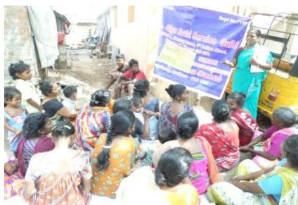
Awareness on Immunisation at Kennedy Nagar area