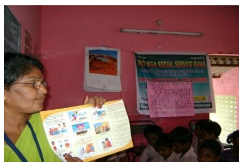
Child rights education through flip chart