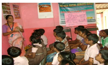
Child rights education to School Children