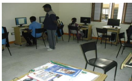
Diploma in Computer Education