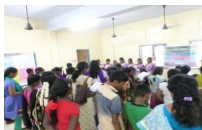
Life skill education to Children Club members