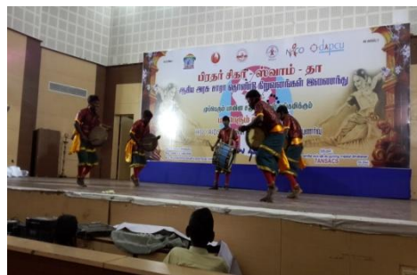
Networking NGO's Celebrating the cultural Programme