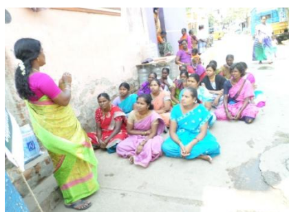
Child rights education to Community people