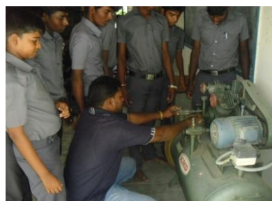
Diploma in Four Wheeler Mechanism Course - Theory and Practical