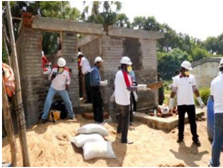
House construction Programme supported by Habitat for Humanity India Trust