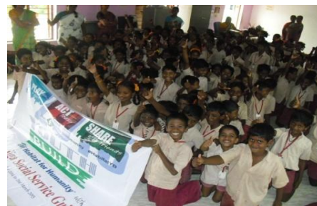
Youth Build Programme in School