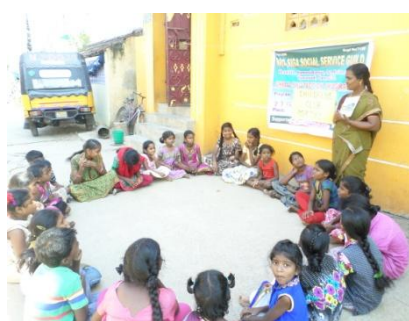
Children clubs being activated in area level –C-Kalyanapuram and B-Kalyanapuram

a) Health: - The same team of workers continued 79 cases of family problems were referred for counselling 42 child labours identified. Either they were re enrolled or sent for vocational training.