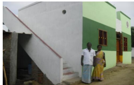
Construction of Karpagam House Maruthuvampadi