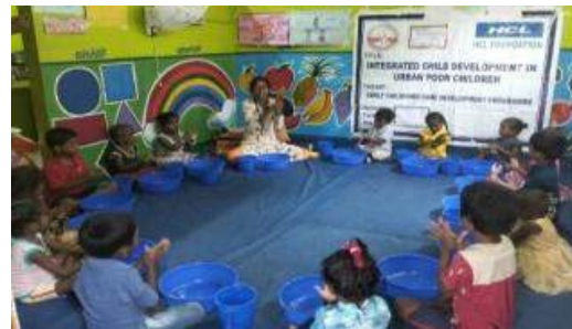
Children celebrating Global hand washing day on 15 th October 2022