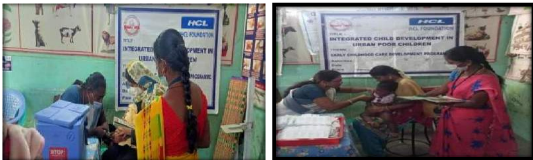
BSSSG in association with PHC, done Immunisation for children

Monthly once, the Health Nurse from PHC came to community and visit our ECCD center and gave vaccination to children as per the scheduled date. The parents motivated for vaccination on scheduled date and they bring their children for vaccination along with the card. In our ECCD Centres 350 children immunised.