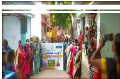
World Breast Feeding Day Madurai and Chennai