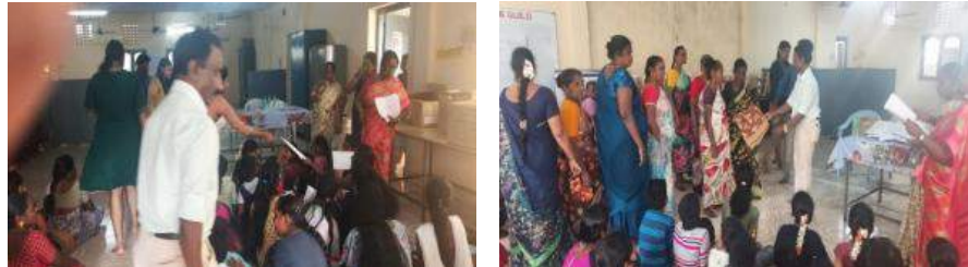
The Temenos company team distributing education materials and blankets to women