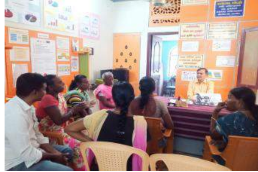
Meeting with all NGOs staff