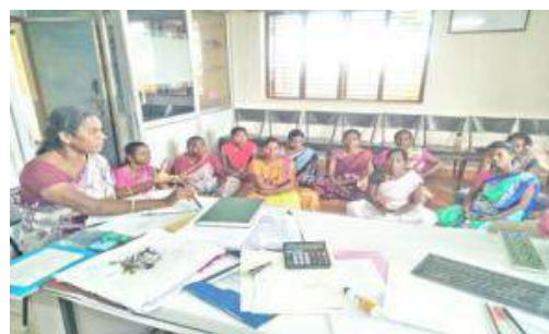
SHG Leaders and members training in Uthiramerur block