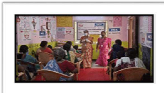
Parents meeting in Madurai