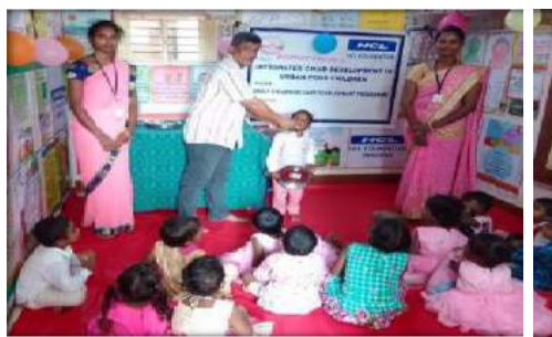
Children played Fun games