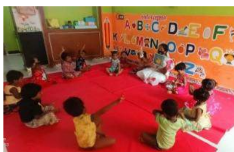
Children Learning Language development and doing action