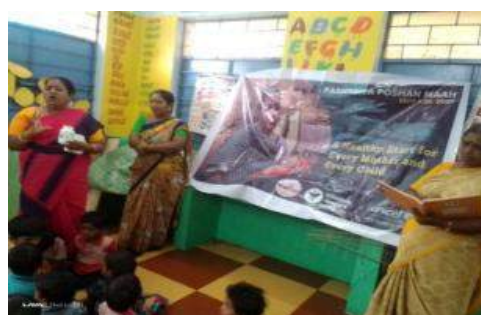
Rashtriya Poshan Maah programme to Anganwadi teachers and Parents