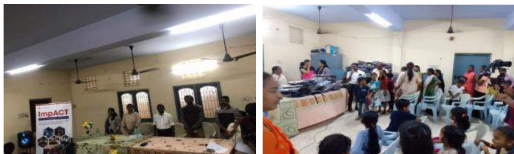
Gift Distribution by Altimetric Volunteers

Again, On 4 th March 2023 , continuation of this ‘ Be a Santa ’ programme, Volunteers from Altimetrik software company visited to BSSSG office Vyasarpadi. We have organized programme for 105 children and parents also attended.