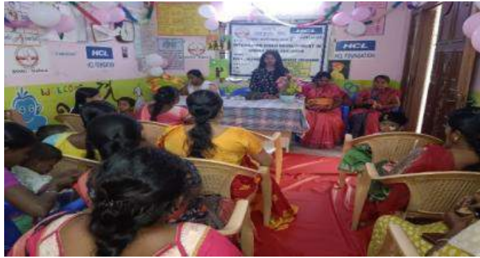
World Women's Day