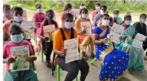
Global Hand Washing Day – Mothers and Stakeholders participated