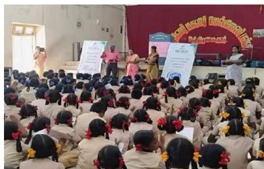
Govt Girls H.S.S.-Uthiramerur-EAP Session