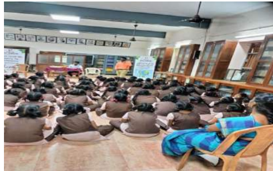
Annaporani Amma model school 241 participated and Rama Krishna Mission Saradha Vidyalaya Hr. Sec. School T. Nagar-516 students the program conducted by Ropes & Bro. Siga team