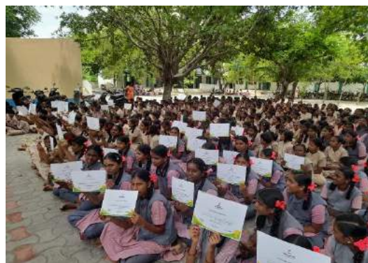
Awareness on Environmental and Education programme conducted at Panchayat union school, Vedapalayam, Uthiramerur block, Kanchipuram District. Participated Students received certificate