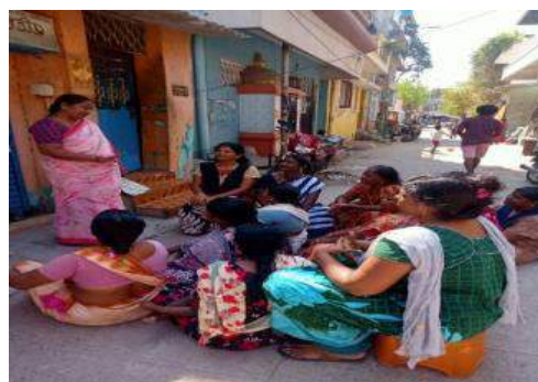
A-Kalyanapuram Alli Malar Magalir SHG