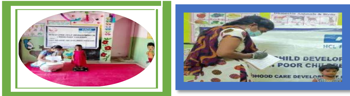
ECCD Teachers monitoring the Children Growth

mentioned in the medical card. Growth monitoring is the regular measurement of a child's size (weight, height, or length) in order to record in the documents.