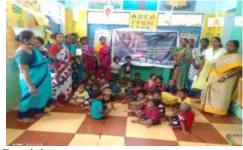
Visibility of Banner with Participants