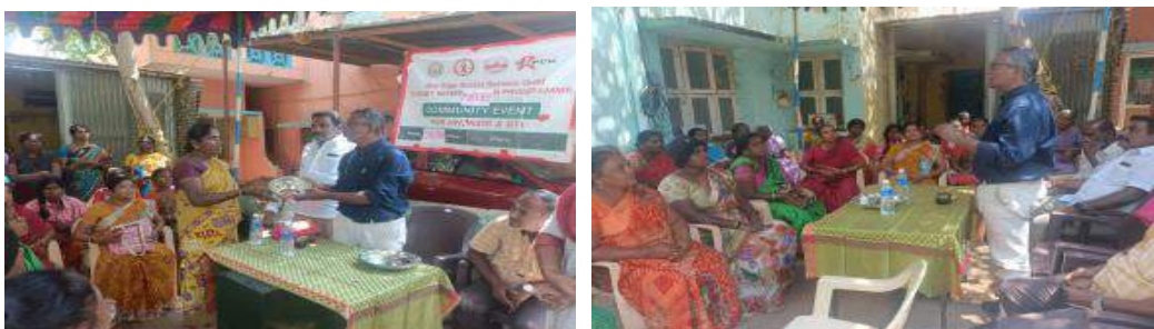
Community Event Pictures

On 15/2/2023 – we have conducted COMMUNITY EVENT in Thirumangalam. We have done HIV/STI awareness and HIV/VDRL- MEDICAL CAMP is going in between of community event. In this event totally 155 HRGH's participated and 155 were tested HIV/VDRL and TB verbal screening.