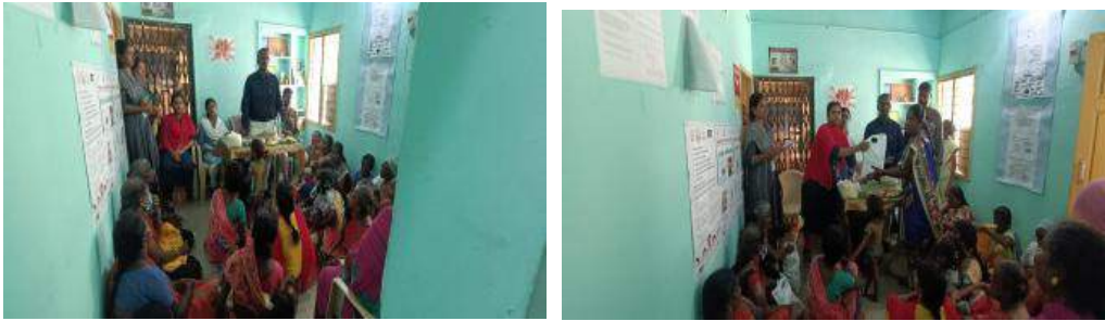
TANSACS District Programme Manager Distributed Rice & Grocery to PLHIV

On 15/02/2023 – Our DPM have provided and distributed Rice, grocery to (PLHIV- PEOPLE LIVING WITH HIV) in Madurai Female Sex Workers Project.