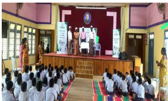
EAP Session at Don Bosco Nursery & Primary School