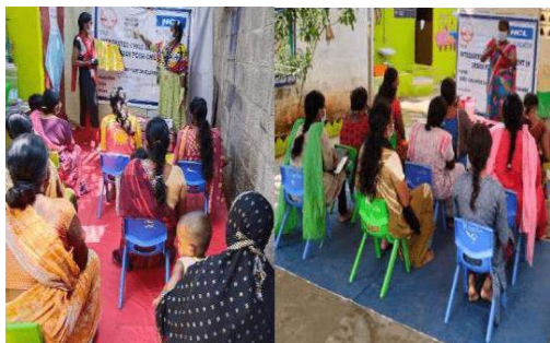
Parents meeting in Chennai

Once in a month Parent's meeting was conducted in Chennai and Madurai locations. Both teachers and parents exchange observations of child's development. This meeting helps the parents to understand their child progress and behaviour. Totally reached out to 700 Parents.