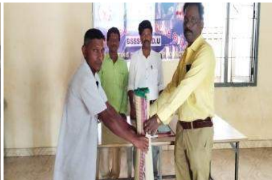
Distributed mat to HRG