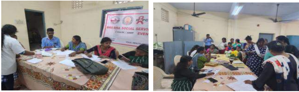
Organised Medical Camp at BSSSG Training Hall

In this camp we delivered awareness speech on RNTCP, HIV/AIDS and STI and condom usage. In this event totally 137 HRGH's participated and 108 were tested.