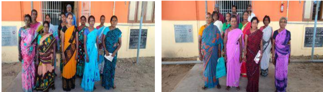
Saratha Magalir SHG Kannikulam village and Kamathenu Magalir SHG Kunnavakkam village received loan cheque from BSSSG