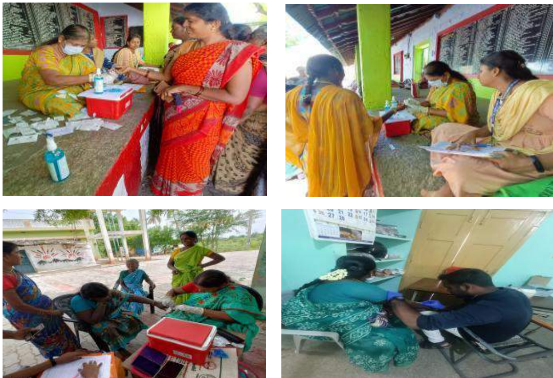
Organised Medical Camp for Target Community

We have conducted CBS Camp from November 2022 to March 2023. There are 631 HRG's are tested through medical camp.