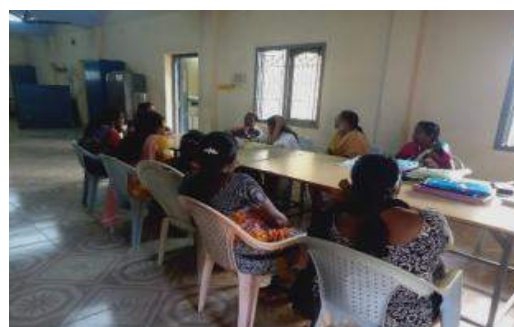
SHG Books of Accounts Follow up Training in Chennai