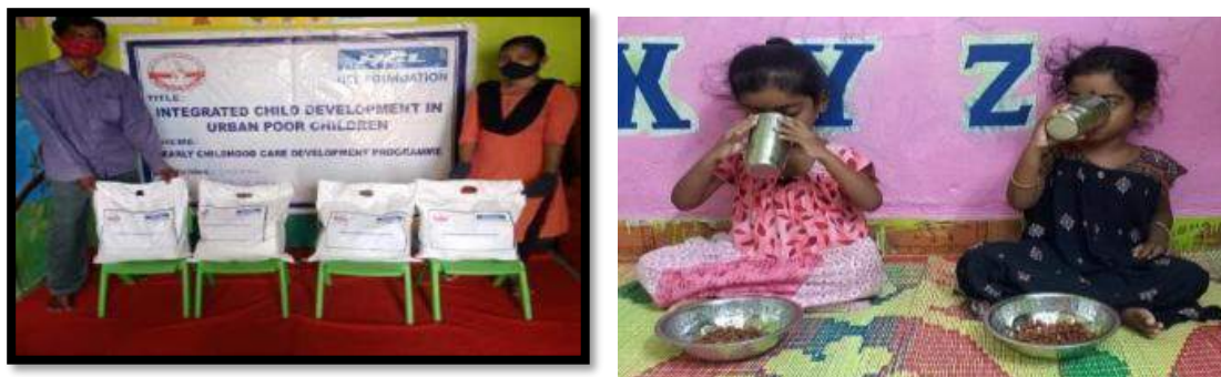
Provide Dry ration to Children family and

In our ECCD Centres all 350 children have received cooked Nutritious Food on daily basis and monitored their health and nutrition status.