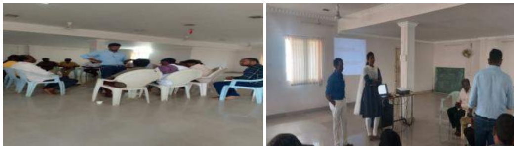
Focus Group Discussion for Male