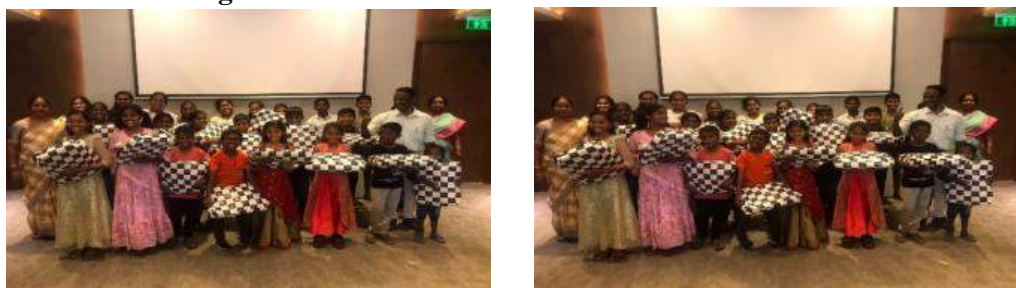
The Altimetrik India distributing Gift to our target children. Children having Gift package

Again, On 4 th March 2023 , continuation of this ‘ Be a Santa ’ programme, Volunteers from Altimetrik software company visited to BSSSG office Vyasarpadi. We have organized programme for 105 children and parents also attended.