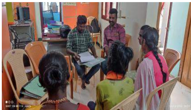
Peer Educators attended weekly review meeting

We have conducted 36 weekly PE review meetings in this year. During the meeting the Project Manager talked about better project implementation and weekly monitoring and evaluation.