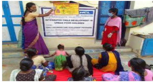
Child Labour Day