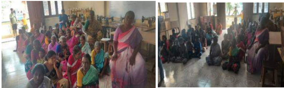
The children and women attended the programme

On 27 th December 2022, we organized the distribution of education materials to 130 children and distribution of blankets to 30 single women. These materials supported by Temenos software company with the help of Praise Foundation.