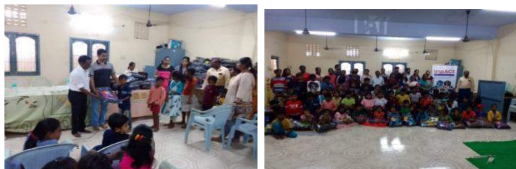
Group photo (beneficiaries, Volunteers & BSSSG Staff)