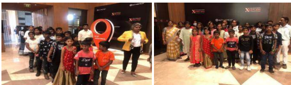
The target children entered at Hotel Grant Sheraton