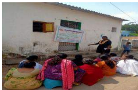
Meeting with Uthappoo Magalir SHG at Kennady Nagar area