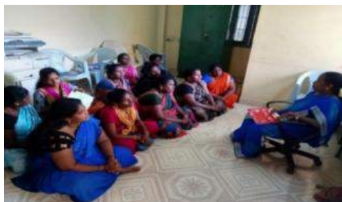
Self Help Group Meeting at Uthiramerur and Chennai BSSSG Office