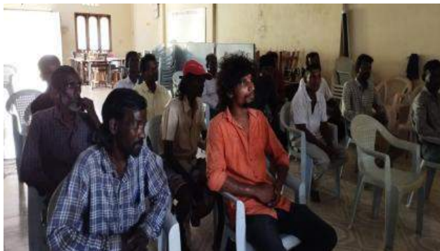
Conduct meeting to Inject Drug Users