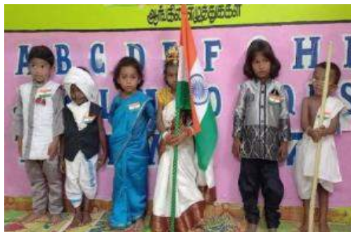
Independence Day Celebration in Chennai and Madurai location