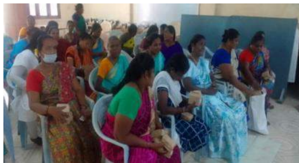
The SHG women received sanitary pad