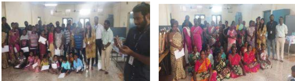
Visibility of Beneficiaries