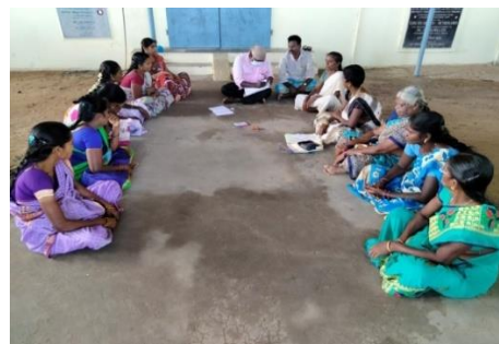
Meeting with SHG members in Uthiramerur villages