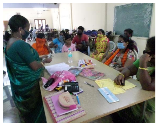
Meeting with SHG members on Micro Finance and Prevention of COVID 19