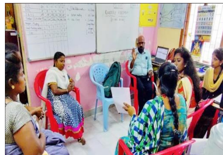
BSSSG Project Director and TANSACS Project Officer visited the DIC and meeting with TI Staff